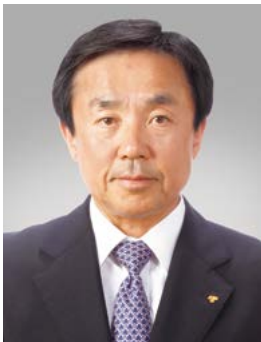
Executive Vice President Shinya Furukawa