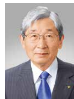
Chairman Tetsuro Toyoda