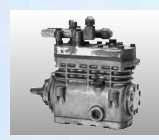
Production of car air-conditioning compressors started