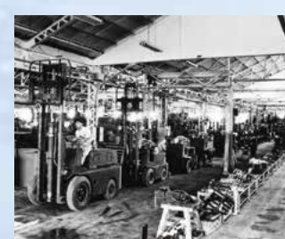
Production of lift trucks started