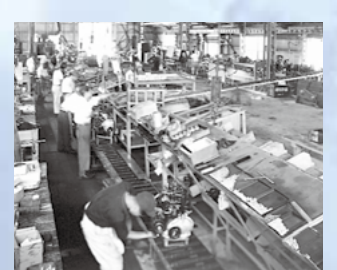
roduction of Type S engines started